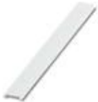
Zack Marker strip, flat, Strip, can be ordered: Strip, white, labeled according to customer specifications, mounting type: snap into flat marker groove, for terminal block width: 6.2 mm, lettering field size: 5.15 x 6.15 mm, Number of individual labels: 10

Zack Marker strip, flat - ZBF 6 CUS - 0825027