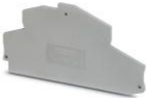
The figure shows a similar product

End cover, length: 96 mm, width: 2.2 mm, height: 46.8 mm, color: gray