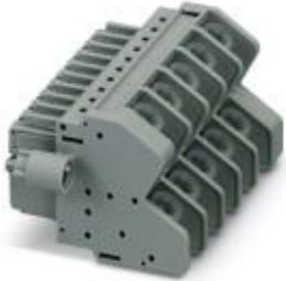
Plug for five current transformers, each with leading transformer short circuit

Please be informed that the data shown in this PDF Document is generated from our Online Catalog. Please find the complete data in the user's documentation. Our General Terms of Use for Downloads are valid ( http://phoenixcontact.com/download )