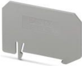
Partition plate, length: 64.4 mm, width: 2 mm, height: 41.8 mm, color: gray

Please be informed that the data shown in this PDF Document is generated from our Online Catalog. Please find the complete data in the user's documentation. Our General Terms of Use for Downloads are valid ( http://phoenixcontact.com/download )