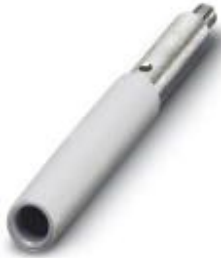
Female test connector, color: gray

Please be informed that the data shown in this PDF Document is generated from our Online Catalog. Please find the complete data in the user's documentation. Our General Terms of Use for Downloads are valid ( http://phoenixcontact.com/download )