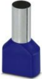
Ferrule, sleeve length: 16 mm, length: 31 mm, color: blue

Please be informed that the data shown in this PDF Document is generated from our Online Catalog. Please find the complete data in the user's documentation. Our General Terms of Use for Downloads are valid ( http://phoenixcontact.com/download )