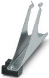
Replacement swivel arm, for the crimping device CF 3000-2,5

Please be informed that the data shown in this PDF Document is generated from our Online Catalog. Please find the complete data in the user's documentation. Our General Terms of Use for Downloads are valid ( http://phoenixcontact.com/download )