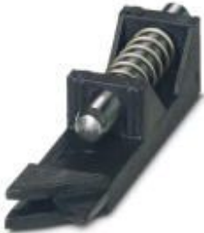
Replacement centering fork (bottom), for the crimping device CF 3000-2,5

Please be informed that the data shown in this PDF Document is generated from our Online Catalog. Please find the complete data in the user's documentation. Our General Terms of Use for Downloads are valid ( http://phoenixcontact.com/download )