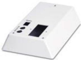
Rear housing part for crimping machine

Please be informed that the data shown in this PDF Document is generated from our Online Catalog. Please find the complete data in the user's documentation. Our General Terms of Use for Downloads are valid ( http://phoenixcontact.com/download )