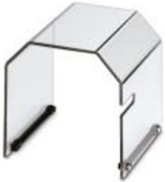
Replacement hood, for the crimping device CF 3000-2,5

Please be informed that the data shown in this PDF Document is generated from our Online Catalog. Please find the complete data in the user's documentation. Our General Terms of Use for Downloads are valid ( http://phoenixcontact.com/download )