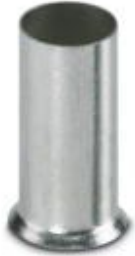
Ferrule, length: 18 mm, color: silver

Please be informed that the data shown in this PDF Document is generated from our Online Catalog. Please find the complete data in the user's documentation. Our General Terms of Use for Downloads are valid ( http://phoenixcontact.com/download )