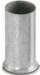
Ferrule, length: 15 mm, color: silver

Please be informed that the data shown in this PDF Document is generated from our Online Catalog. Please find the complete data in the user's documentation. Our General Terms of Use for Downloads are valid ( http://phoenixcontact.com/download )