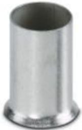
Ferrule, length: 12 mm, color: silver

Please be informed that the data shown in this PDF Document is generated from our Online Catalog. Please find the complete data in the user's documentation. Our General Terms of Use for Downloads are valid ( http://phoenixcontact.com/download )