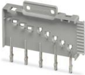
Strain relief, with double-sided coupling spring, for two 10-pos. connector shells

Please be informed that the data shown in this PDF Document is generated from our Online Catalog. Please find the complete data in the user's documentation. Our General Terms of Use for Downloads are valid ( http://phoenixcontact.com/download )