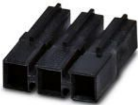
Connector housing, number of positions: 3, color: black

Please be informed that the data shown in this PDF Document is generated from our Online Catalog. Please find the complete data in the user's documentation. Our General Terms of Use for Downloads are valid ( http://phoenixcontact.com/download )