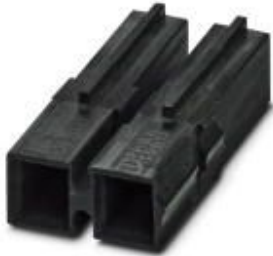
Connector housing, number of positions: 2, color: black

Please be informed that the data shown in this PDF Document is generated from our Online Catalog. Please find the complete data in the user's documentation. Our General Terms of Use for Downloads are valid ( http://phoenixcontact.com/download )