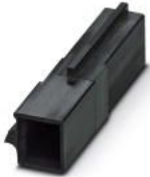
Connector housing, number of positions: 1, color: black

Please be informed that the data shown in this PDF Document is generated from our Online Catalog. Please find the complete data in the user's documentation. Our General Terms of Use for Downloads are valid ( http://phoenixcontact.com/download )