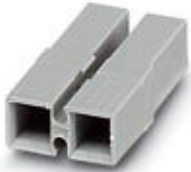
Connector housing, number of positions: 2, color: gray

Please be informed that the data shown in this PDF Document is generated from our Online Catalog. Please find the complete data in the user's documentation. Our General Terms of Use for Downloads are valid ( http://phoenixcontact.com/download )