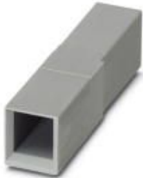
Connector housing, number of positions: 1, color: gray

Please be informed that the data shown in this PDF Document is generated from our Online Catalog. Please find the complete data in the user's documentation. Our General Terms of Use for Downloads are valid ( http://phoenixcontact.com/download )