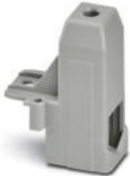
Empty enclosure, color: gray

Please be informed that the data shown in this PDF Document is generated from our Online Catalog. Please find the complete data in the user's documentation. Our General Terms of Use for Downloads are valid ( http://phoenixcontact.com/download )