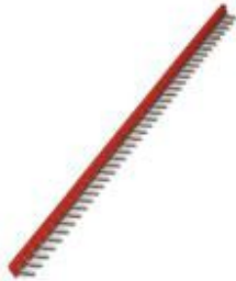
Insertion bridge, divisible, 80-pos., insulation material: Red

Please be informed that the data shown in this PDF Document is generated from our Online Catalog. Please find the complete data in the user's documentation. Our General Terms of Use for Downloads are valid ( http://phoenixcontact.com/download )