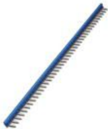
Insertion bridge, divisible, 80-pos., insulation material: Blue

Please be informed that the data shown in this PDF Document is generated from our Online Catalog. Please find the complete data in the user's documentation. Our General Terms of Use for Downloads are valid ( http://phoenixcontact.com/download )