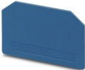
End cover, length: 46.2 mm, width: 1 mm, height: 28.3 mm, color: blue

Please be informed that the data shown in this PDF Document is generated from our Online Catalog. Please find the complete data in the user's documentation. Our General Terms of Use for Downloads are valid ( http://phoenixcontact.com/download )