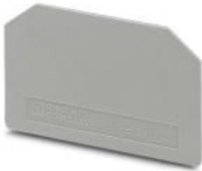
End cover, length: 46 mm, width: 1 mm, height: 28.7 mm, color: gray

Please be informed that the data shown in this PDF Document is generated from our Online Catalog. Please find the complete data in the user's documentation. Our General Terms of Use for Downloads are valid ( http://phoenixcontact.com/download )