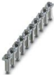
Fixed bridge, pitch: 17 mm, number of positions: 10, color: silver

Please be informed that the data shown in this PDF Document is generated from our Online Catalog. Please find the complete data in the user's documentation. Our General Terms of Use for Downloads are valid ( http://phoenixcontact.com/download )