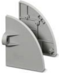
Flange, number of positions: 0, color: gray

Please be informed that the data shown in this PDF Document is generated from our Online Catalog. Please find the complete data in the user's documentation. Our General Terms of Use for Downloads are valid ( http://phoenixcontact.com/download )