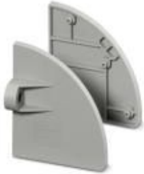
Flange, number of positions: 0, color: gray

Please be informed that the data shown in this PDF Document is generated from our Online Catalog. Please find the complete data in the user's documentation. Our General Terms of Use for Downloads are valid ( http://phoenixcontact.com/download )