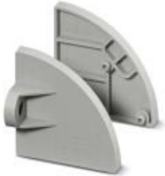
Flange, number of positions: 0, color: gray

Please be informed that the data shown in this PDF Document is generated from our Online Catalog. Please find the complete data in the user's documentation. Our General Terms of Use for Downloads are valid ( http://phoenixcontact.com/download )