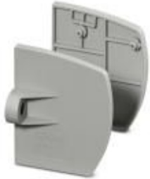
Flange, number of positions: 0, color: gray

Please be informed that the data shown in this PDF Document is generated from our Online Catalog. Please find the complete data in the user's documentation. Our General Terms of Use for Downloads are valid ( http://phoenixcontact.com/download )