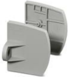
Flange, number of positions: 0, color: gray

Please be informed that the data shown in this PDF Document is generated from our Online Catalog. Please find the complete data in the user's documentation. Our General Terms of Use for Downloads are valid ( http://phoenixcontact.com/download )