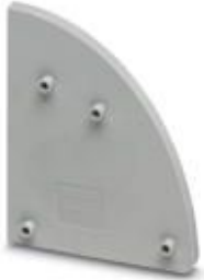
Spacer plate, number of positions: 0, pitch: 0 mm, color: gray

Please be informed that the data shown in this PDF Document is generated from our Online Catalog. Please find the complete data in the user's documentation. Our General Terms of Use for Downloads are valid ( http://phoenixcontact.com/download )