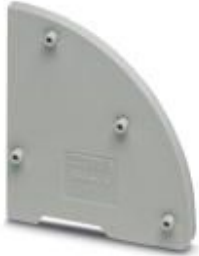
Spacer plate, number of positions: 0, pitch: 0 mm, color: gray

Please be informed that the data shown in this PDF Document is generated from our Online Catalog. Please find the complete data in the user's documentation. Our General Terms of Use for Downloads are valid ( http://phoenixcontact.com/download )