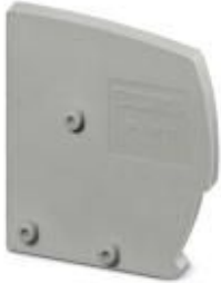
Spacer plate, number of positions: 0, pitch: 0 mm, color: gray

Please be informed that the data shown in this PDF Document is generated from our Online Catalog. Please find the complete data in the user's documentation. Our General Terms of Use for Downloads are valid ( http://phoenixcontact.com/download )