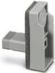
Mounting material, number of positions: 0, color: gray

Please be informed that the data shown in this PDF Document is generated from our Online Catalog. Please find the complete data in the user's documentation. Our General Terms of Use for Downloads are valid ( http://phoenixcontact.com/download )