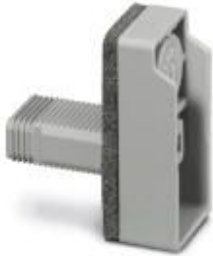
Mounting material, number of positions: 0, color: gray

Please be informed that the data shown in this PDF Document is generated from our Online Catalog. Please find the complete data in the user's documentation. Our General Terms of Use for Downloads are valid ( http://phoenixcontact.com/download )