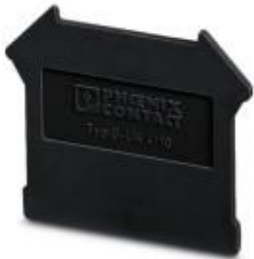
End cover, color: black

Please be informed that the data shown in this PDF Document is generated from our Online Catalog. Please find the complete data in the user's documentation. Our General Terms of Use for Downloads are valid ( http://phoenixcontact.com/download )