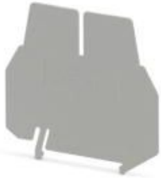
Separating plate, length: 66.5 mm, width: 1 mm, height: 62.5 mm, color: gray

Please be informed that the data shown in this PDF Document is generated from our Online Catalog. Please find the complete data in the user's documentation. Our General Terms of Use for Downloads are valid ( http://phoenixcontact.com/download )