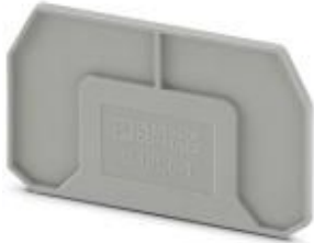
End cover, length: 66.5 mm, width: 2.2 mm, height: 37.9 mm, color: gray

Please be informed that the data shown in this PDF Document is generated from our Online Catalog. Please find the complete data in the user's documentation. Our General Terms of Use for Downloads are valid ( http://phoenixcontact.com/download )