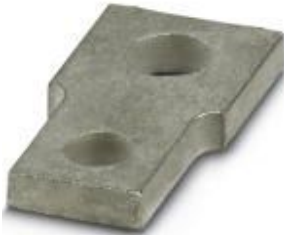
Connection element, number of positions: 2, color: silver

Please be informed that the data shown in this PDF Document is generated from our Online Catalog. Please find the complete data in the user's documentation. Our General Terms of Use for Downloads are valid ( http://phoenixcontact.com/download )