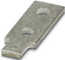
Connection element, number of positions: 3, color: silver

Please be informed that the data shown in this PDF Document is generated from our Online Catalog. Please find the complete data in the user's documentation. Our General Terms of Use for Downloads are valid ( http://phoenixcontact.com/download )