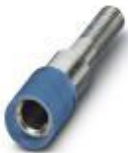
Female test connector, color: blue

Female test connector - PSBJ 4/15/6 BU - 0303354