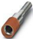
Female test connector, color: red

Female test connector - PSBJ 4/15/6 RD - 0303325