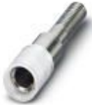
Female test connector, color: transparent

Female test connector - PSBJ 4/15/6 FARBLOS - 0303419