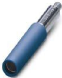
Female test connector, color: blue

Please be informed that the data shown in this PDF Document is generated from our Online Catalog. Please find the complete data in the user's documentation. Our General Terms of Use for Downloads are valid ( http://phoenixcontact.com/download )