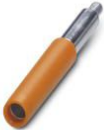
Female test connector, color: orange

Please be informed that the data shown in this PDF Document is generated from our Online Catalog. Please find the complete data in the user's documentation. Our General Terms of Use for Downloads are valid ( http://phoenixcontact.com/download )