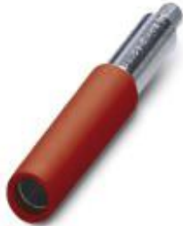
Female test connector, color: red

Please be informed that the data shown in this PDF Document is generated from our Online Catalog. Please find the complete data in the user's documentation. Our General Terms of Use for Downloads are valid ( http://phoenixcontact.com/download )