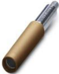
Female test connector, color: brown

Please be informed that the data shown in this PDF Document is generated from our Online Catalog. Please find the complete data in the user's documentation. Our General Terms of Use for Downloads are valid ( http://phoenixcontact.com/download )