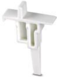
Switching lock, length: 12 mm, width: 8.2 mm, color: white

Please be informed that the data shown in this PDF Document is generated from our Online Catalog. Please find the complete data in the user's documentation. Our General Terms of Use for Downloads are valid ( http://phoenixcontact.com/download )