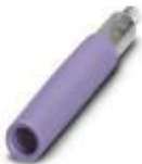
Female test connector, color: violet

Female test connector - PSBJ-URTK 6 VT - 3026421