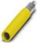
Female test connector, color: yellow

Female test connector - PSBJ-URTK 6 YE - 3026405