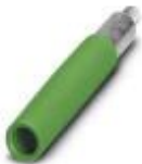
Female test connector, color: green

Female test connector - PSBJ-URTK 6 GN - 3026418