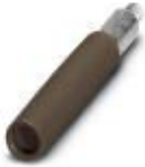
Female test connector, color: brown

Female test connector - PSBJ-URTK 6 BN - 3026971