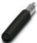
Female test connector, color: black

Female test connector - PSBJ-URTK 6 BK - 3026447