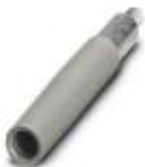
Female test connector, color: gray

Female test connector - PSBJ-URTK 6 GY - 3026612