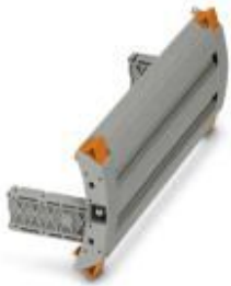
Dummy plug, pitch: 8.2 mm, length: 72.9 mm, width: 212.8 mm, number of positions: 22, color: gray

Please be informed that the data shown in this PDF Document is generated from our Online Catalog. Please find the complete data in the user's documentation. Our General Terms of Use for Downloads are valid ( http://phoenixcontact.com/download )