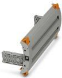
Dummy plug, pitch: 8.2 mm, length: 72.9 mm, width: 204.6 mm, number of positions: 21, color: gray

Please be informed that the data shown in this PDF Document is generated from our Online Catalog. Please find the complete data in the user's documentation. Our General Terms of Use for Downloads are valid ( http://phoenixcontact.com/download )